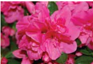
Remembrance Mid - Late