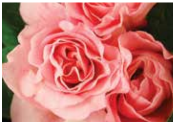
Rozalea Coral Pink Mid - Late