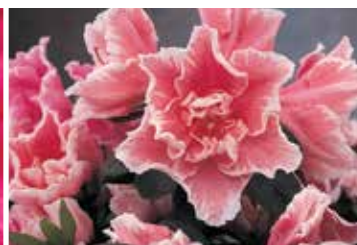
Deloose (Knutte) Mid - Late