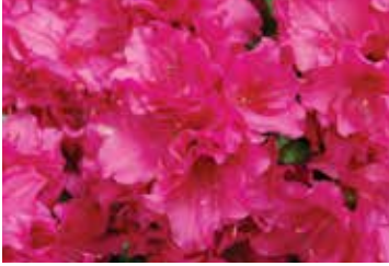
Loyalty Mid - Late

Mid-Season to Late Varieties: These varieties begin shippings from late January through May.