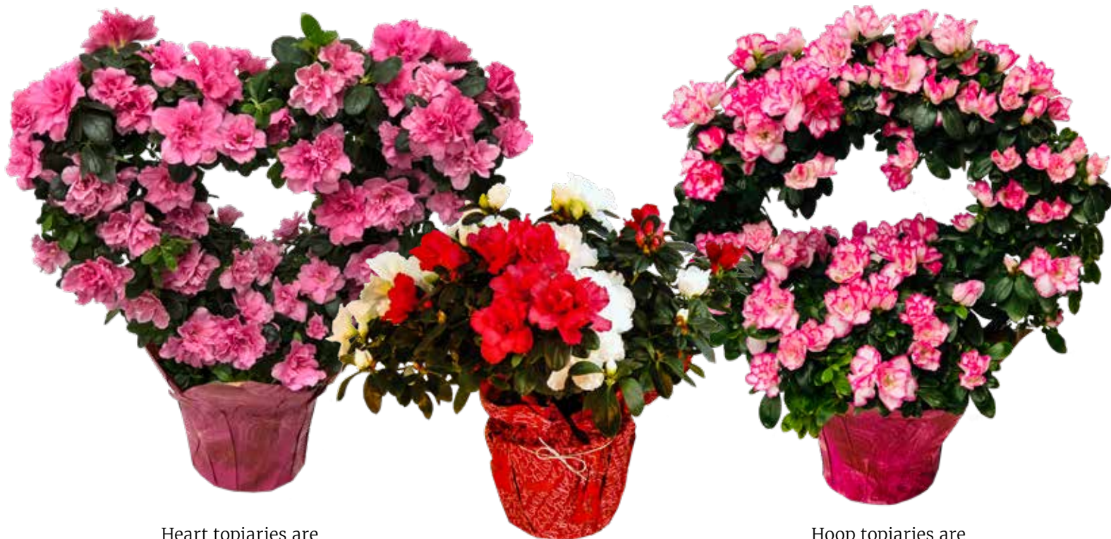
Heart topiaries are available only for Valentine's Day.