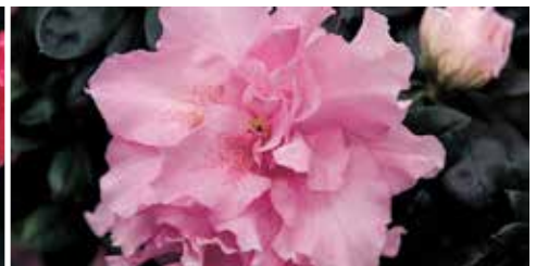
Terra Nova (Vogel) Early - Mid

Mid-Season to Late Varieties: These varieties begin shippings from late January through May .