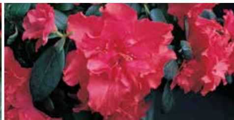
Nordlicht (Vogel) Early - Mid