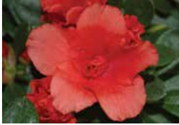
Orange Knute (Knute) Mid - Late