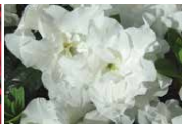
Honesty Mid - Late