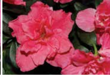
Bella (Vogel) Early - Mid