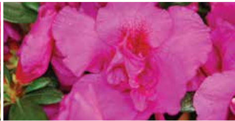
Victoria Mid - Late