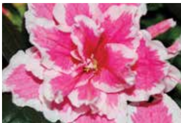
Inga (Vogel) Early - Mid