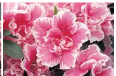
Dewales (Knutte) Mid - Late