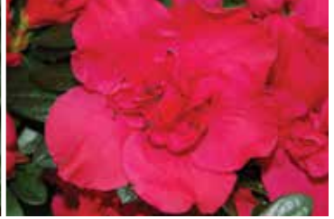
Otto Mid - Late