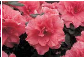
Luntra (Vogel) Early - Mid