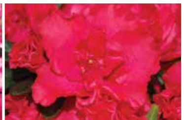
Knute Erwin (Knutte) Mid - Late