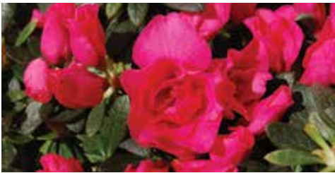
Tamira Mid - Late