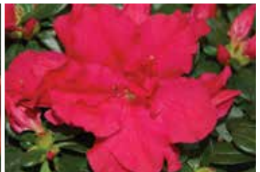
Scarlet Mid - Late