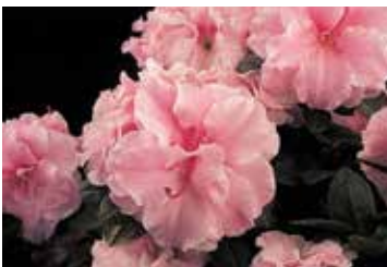
Al Panzer Late

Late Varieties: These varieties typically ship from April into the early part of June.