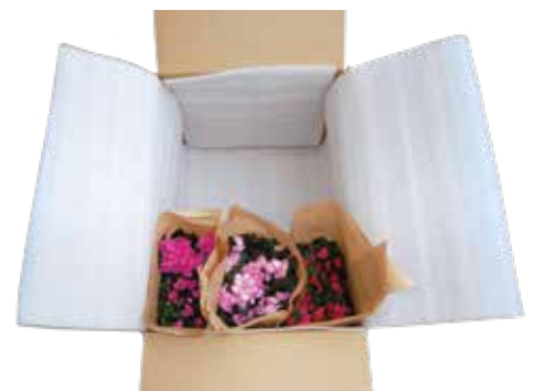
Foam Insulation for winter distribution