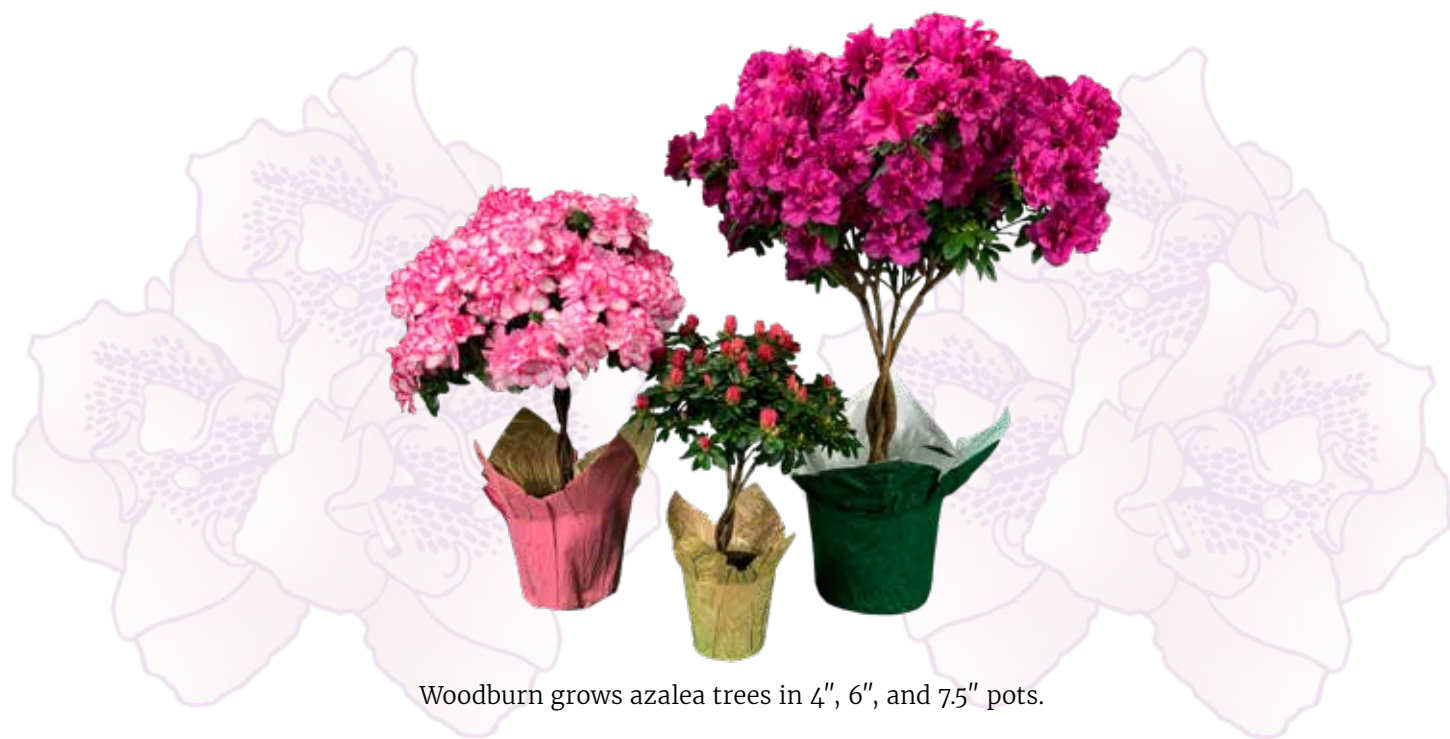
Woodburn grows azalea trees in 4", 6", and 7.5" pots.