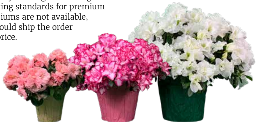
Woodburn grows azaleas in 4", 6" and 8" pots