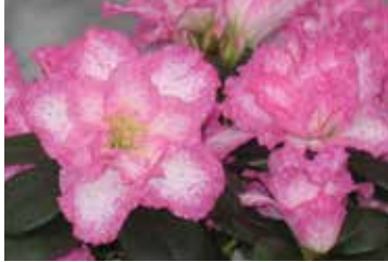
Aquarell (Vogel) Early - Mid

Early to Mid-Season Varieties: These varieties typically ship between June and January .