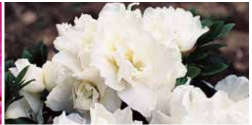
White Knute (Knute) Mid - Late

Late Varieties: These varieties typically ship from April into the early part of June.